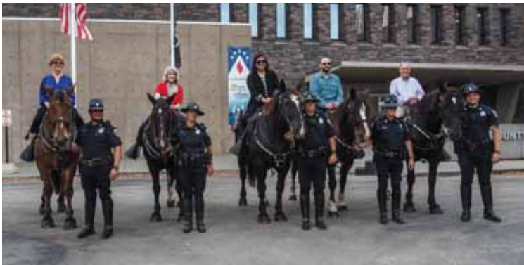
Rotarians joined the mounted patrol.

The Lincoln Avenue Stable is an entirely new concept as it connects the Milwaukee Police Department with equine-assisted therapy. The Stable will house 24 highly trained horses that will be used for equine-assisted therapy, community engagement and Milwaukee Police Department patrols.