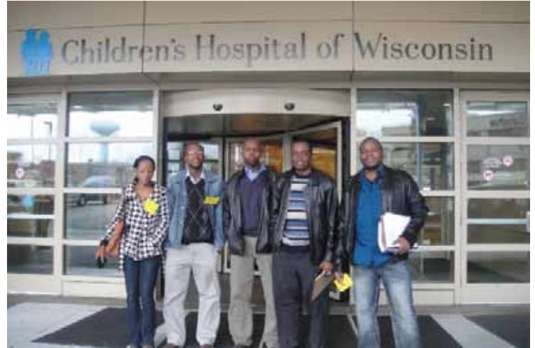
CIH intensive training on pharmacy organization.

macy technicians and dispensers in Lusaka and Livingstone to better organize and manage pharmacy services, thereby enhancing the delivery of quality HIV/AIDS care to mothers, infants, and children.