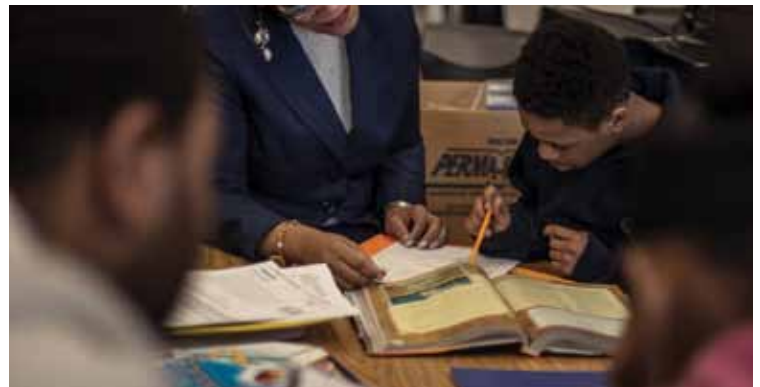
Literacy tutoring at Brown Street Academy.