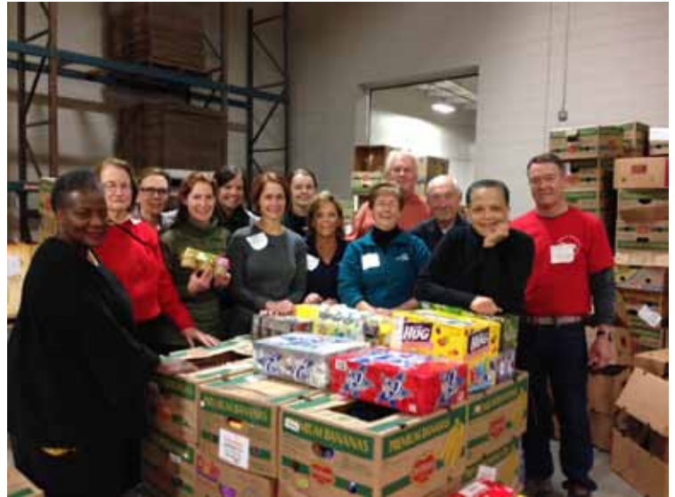
Rotarians sorted food at Feeding America in January.

Reinhart Food Show; most recently, over 20 Rotarians gathered at Feeding America's Fond du Lac Avenue location in January to help sort food for the food bank.